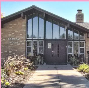
St Francis Retreat Center

St Hippolytus, (8 / 13): According to Franciscan Media's Saint of the Day , 'Hippolytus' means "a horse turned loose". So, we had two Hippolyti at Dainava! Pray for us, St. Hippolytus!